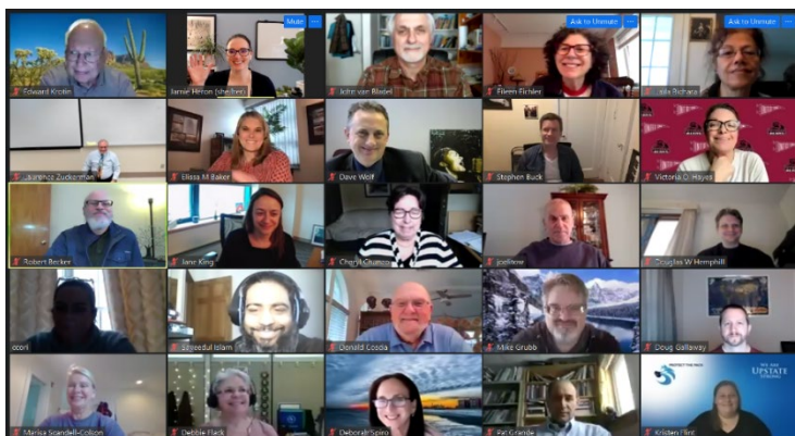
Some Fireside Chat Attendees Before the S’mores were served!

Registration for future chats here: https://dle.suny.edu/fireside-chats/ .