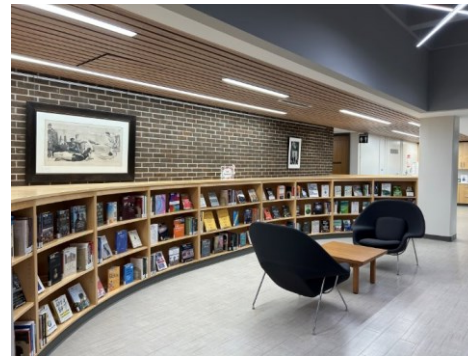
Common area in Milne Library at SUNY Oneonta